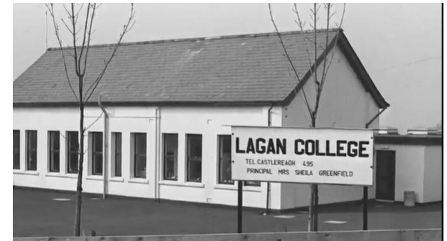
One Docutube referred to the first integrated school in NI.