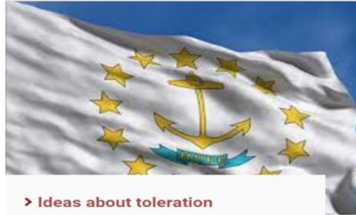
> Ideas about toleration