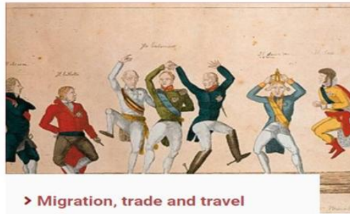
> Migration, trade and travel