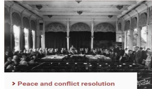
> Peace and conflict resolution