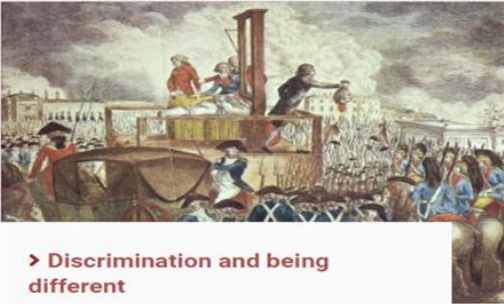
> Discrimination and being different