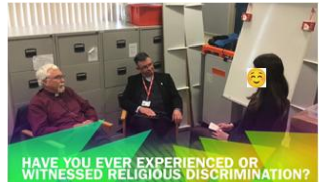
Interview with Church of Ireland bishop and Roman Catholic priest