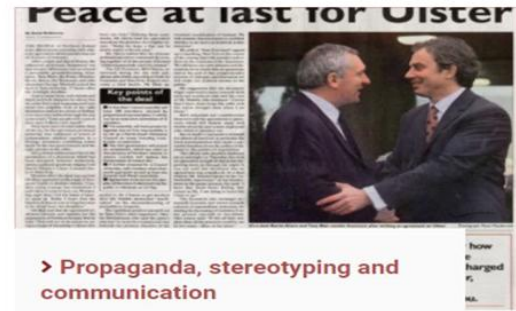
> Propaganda, stereotyping and communication