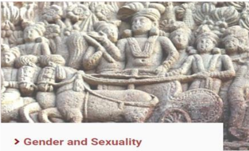
> Gender and Sexuality